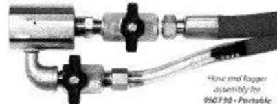
Hose and fogger assembly for 950730 - Portable Precision Fogger